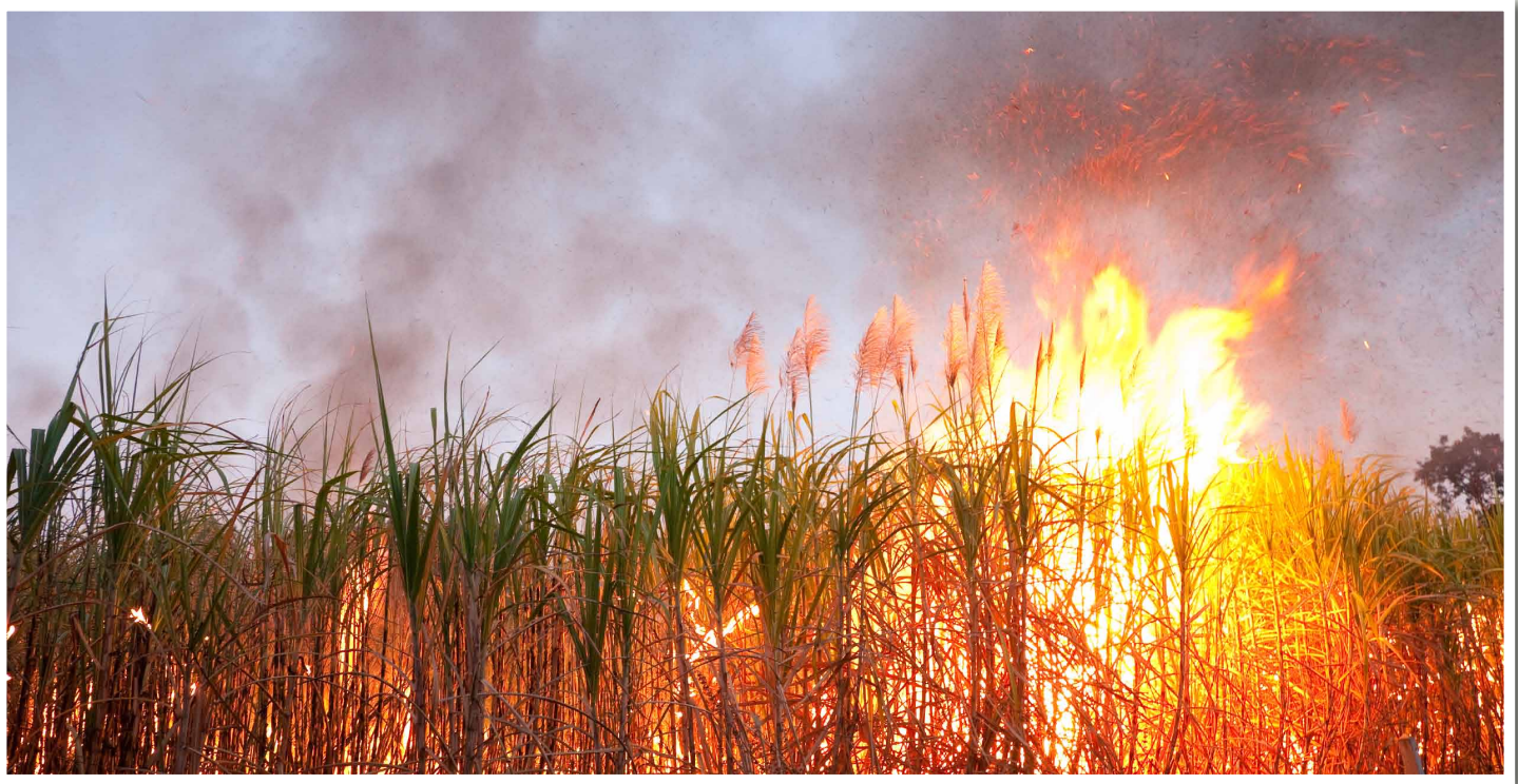
Synthetic biology products depend upon fermenting large quantities of sugarcane. The production and harvesting, including burning, of cane fields releases large amounts of carbon dioxide and causes other environmental and social harms.

Until the above principles are incorporated into international, federal and local law as well as research and industry practices, there must be a moratorium on the release and commercial use of synthetic organisms.