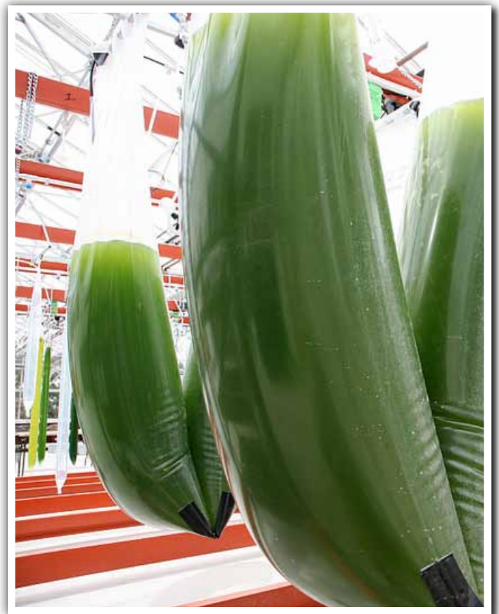
Synthetic algae growing in a greenhouse.

Strict standards that prohibit conflicts of interest should be maintained in the oversight of synthetic biology research, including but not limited to prohibiting persons with financial interests in synthetic biology research, development and commercialization from roles in its health and safety oversight.